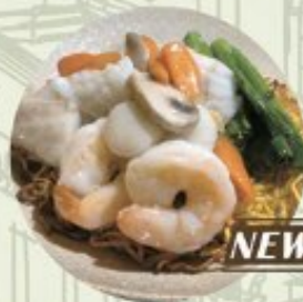
Seafood Crispy Noodle $16.8