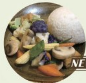
Mixed Vegetable & Tofu with Rice $12.8