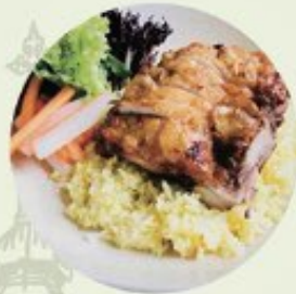
Roasted Chicken Rice $12.8