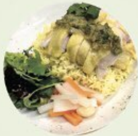
Hainanese Chicken Rice $12.8