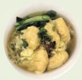
Prawn Wonton (5pcs) Egg Noodle Soup $12.8