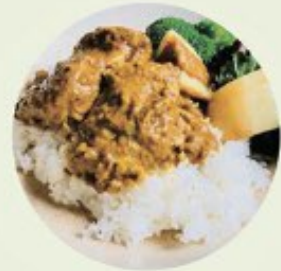
Curry Chicken/ Beef Rice $12.8