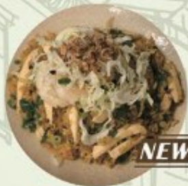
Nasi Goreng $12.8