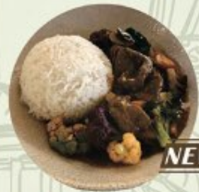
Szechuan Beef with rice $14.8

209 CLARENDON STREET, SOUTH MELBOURNE VIC 3205 Tel:03 9995 6891 Email:info@clarendaonmelbourne.com