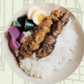
Chicken Skewers & Boiled Egg on Coconut Rice $12.8