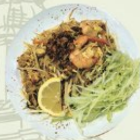
Singapore Noodle $12.8