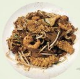
Fried Kuay Teow Mee $12.8